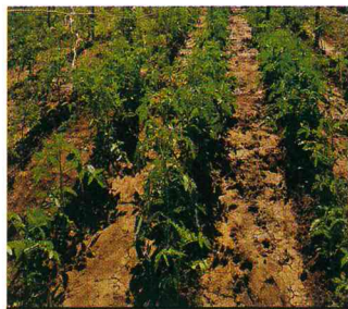
Tomato NURU F1 demo plot at Greenfield, Zambia.