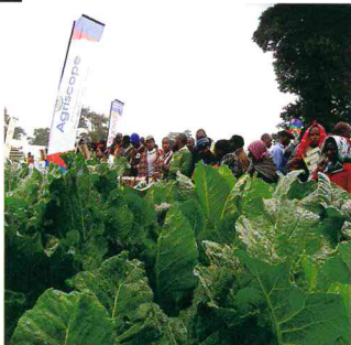
EASEED Staff training Farmers during field-day on Agrochemical Products from Agriscopex.