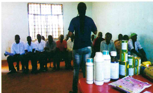
One of the village base agro dealers training in Kwimba in Western Tanzania.

This training covering 7 Districts made over 600 big farmers smile all the way to the banks and changed the livelihoods of over 1200 villages in this region.