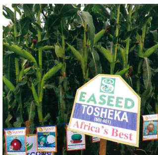
Maize Tosheka (MH401) at Wambugu ATC Farm, Nyeri County, Kenya.