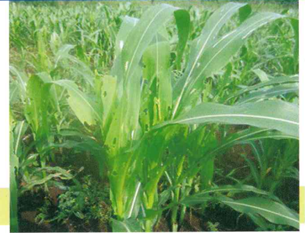
Maize affected by Fall Army Worm.