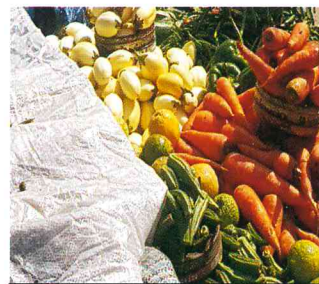
Street Vendors display live produce for sale near city market. Lusaka, Zambia