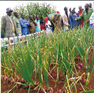
Onion Red Sanga F1 Training during the field-day.