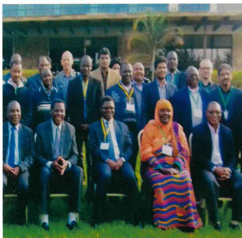
A group photo of the attendants of TASTA workshop in Mt Meru Hotel.