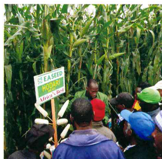
EASEED Staff training farmers during field-day on Maize Hodari (MH501)