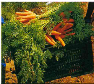
Carrot Harvesting at Meanwood, Lusaka, Zambia.