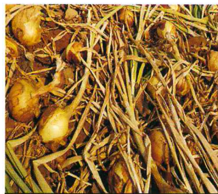
Onion Superex ready for harvesting in Lusaka, Zambia.