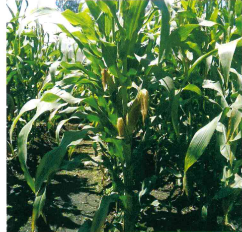
One of our maize VILLAGE BASED AGRO DEALER KH 500 43A demo in Kwimba in Western Tanzania.