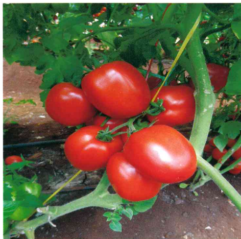
Tomato Bingwa F1 in Northern Tanzania demos.