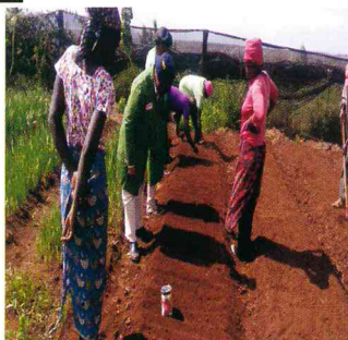
Farmer training on Nursery Establishment for Onion Red Sanga F1.