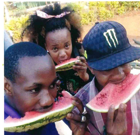
Young farmers enjoying the sweetness of Watermelon Sukari F1.

Quality seeds for the next generation with EASEED