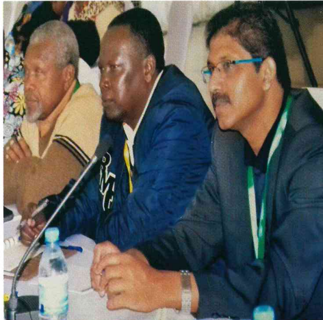
EASEED staff follow proceedings of a workshop organized by TASTA.