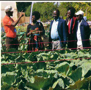
Customers trained in EASEED New Products.