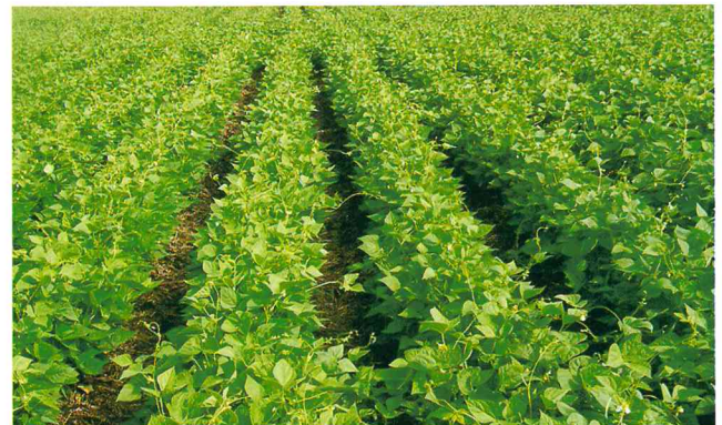
A bean farm in Miwaleni in Moshi District in Northern Tanzania.