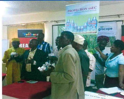
PROFECRON Product launch to farmers.

Agriscope Africa Ltd presents PROFECRON as a solution for the Fall Army Worm to farmers growing Maize. PROFECRON was launched officially by various stake holders for control of the devastating Army Worms in Maize in April. PROFECRON has proved to be the best Insecticide for the pest and is being used by very many farmers including large scale commercial farms in Uganda. PROFECRON should be mixed well at a dose of 40mls in 20 Lts of water and sprayed direct in the maize funnel where the pest normally hides as it feeds on the young leaves.